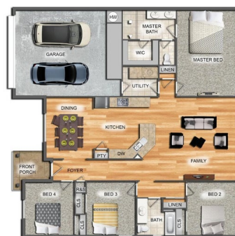
Renderings are not an EXACT representation of finished product, please see ©2022 NMLS, Inc. for each property BREEZE HOMES